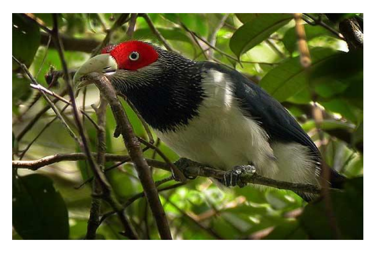
(Endemic Red-faced Malkoha)