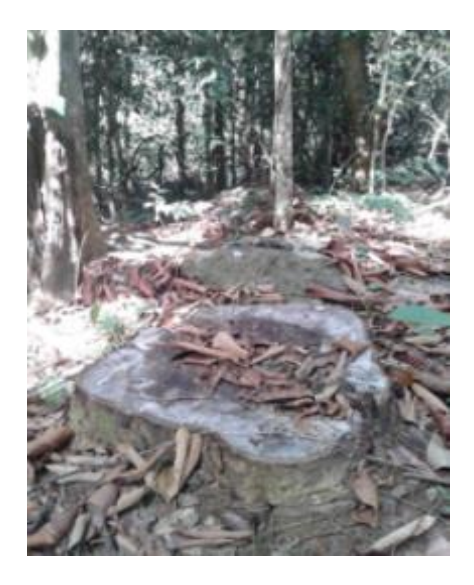
Above: Giant Endemic Hora Trees Below: Recently felled Hora Tree