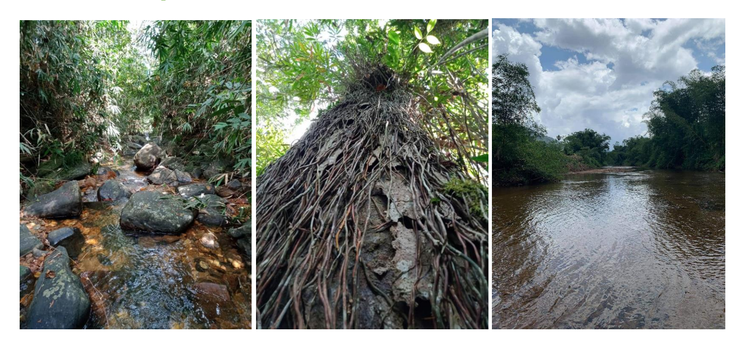
Above: 2 acres within 50m of Sinharaja boundary & 4 acres riverine forest protected bordering Kudawa River, Northern Sinharaja Below: 3 lands in extent 7 acres, 6 acres and 10 acres protected directly bordering Sinharaja World Heritage Rainforest