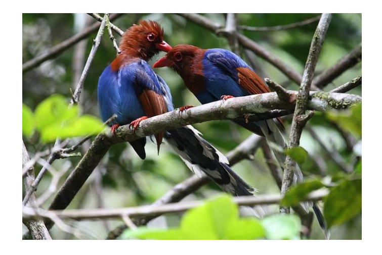
(Endemic Sri Lanka Blue Magpie)