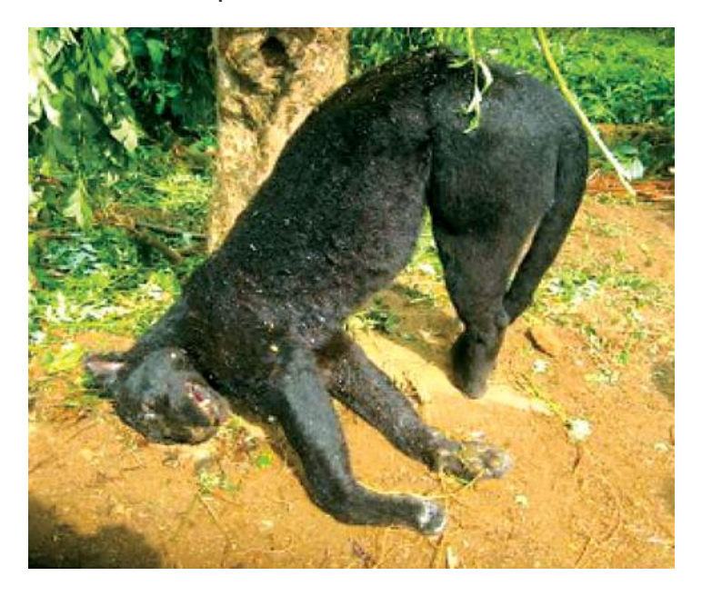
(Rare Black Leopard in buffer zone of Sinharaja Rainforest killed by a poacher's snare – Nov 2013)

Many buffer-zone rainforest lands are still privately owned. Increasingly these lands are being sold and forests cut down for monoculture plantations.